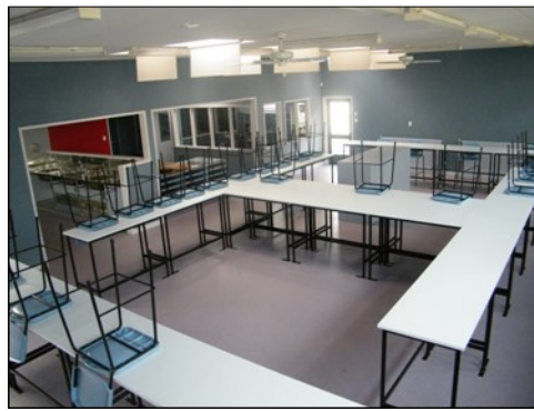
Art Suite refurbishment completed.

As a part of their Matariki studies, class members of 9TH created a colouring competition page for kohanga reo children. Each student designed their own page.