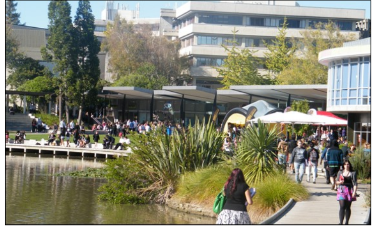
Selected pupils from all levels spent a day at Waikato University.