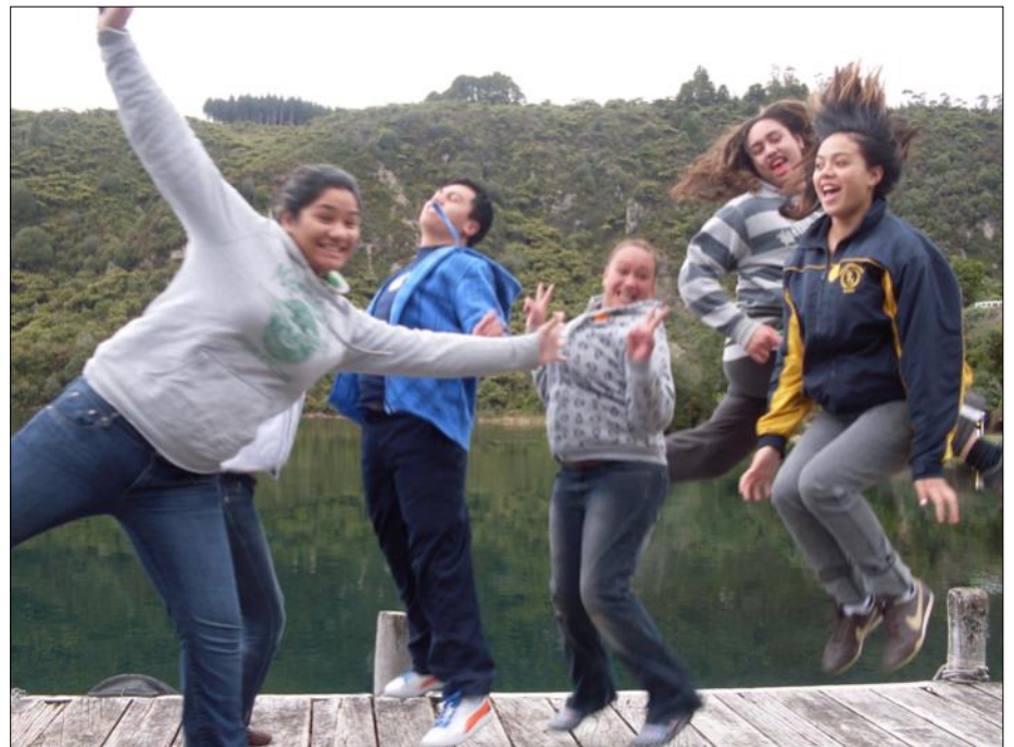
Members of the Senior Tourism class spent their annual two days at Rotorua following the completion of their theory classwork on organising a tourism venture.