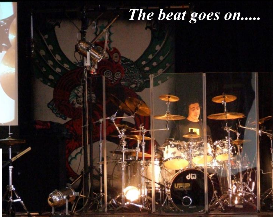
Dylan Elise, drummer, entertained the students at our assembly last week.