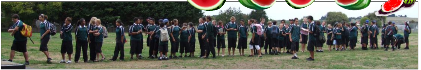
Year 9 students line up for a free lunch of burgers, drinks and watermelon at lunchtime on Tuesday. A few older students tried unsuccessfully to float into the line! The meal was part of the reward system for the students, who have been doing well.