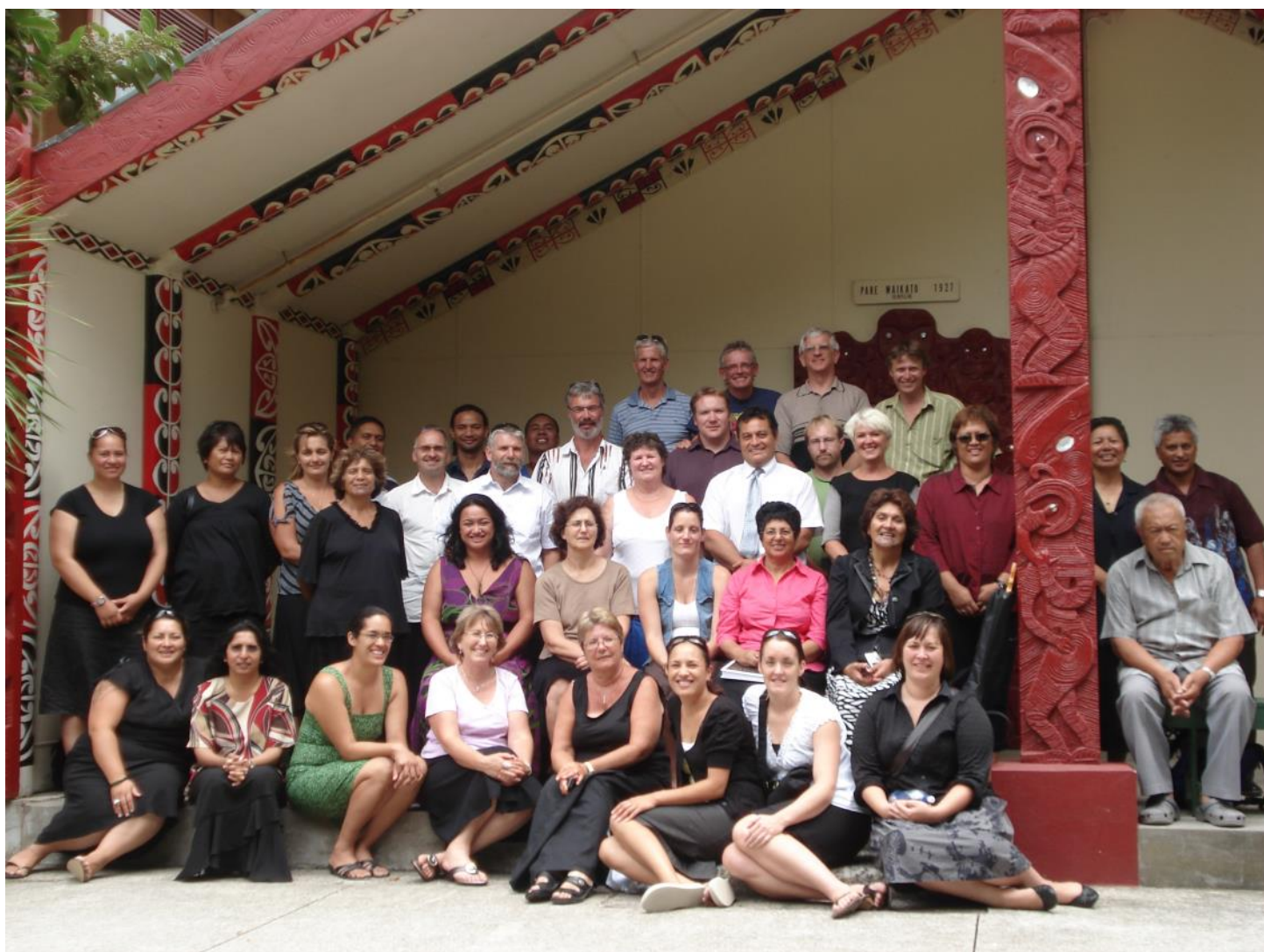
Ngaruawahia High School staff members photographed outside Pare Waikato on Turangawaewae Marae with their hosts during the school's Teacher Only Day at the beginning of the year on January 31st.