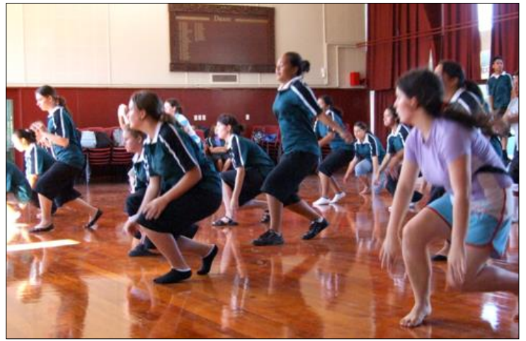
A lot of action, fun and laughter took place at the very first assembly of dancers for our 2008 Stage Challenge practice on Monday.